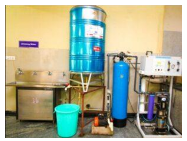
Purified Drinking Water Facility